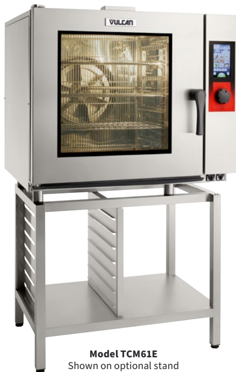
Model TCM61E Shown on optional stand